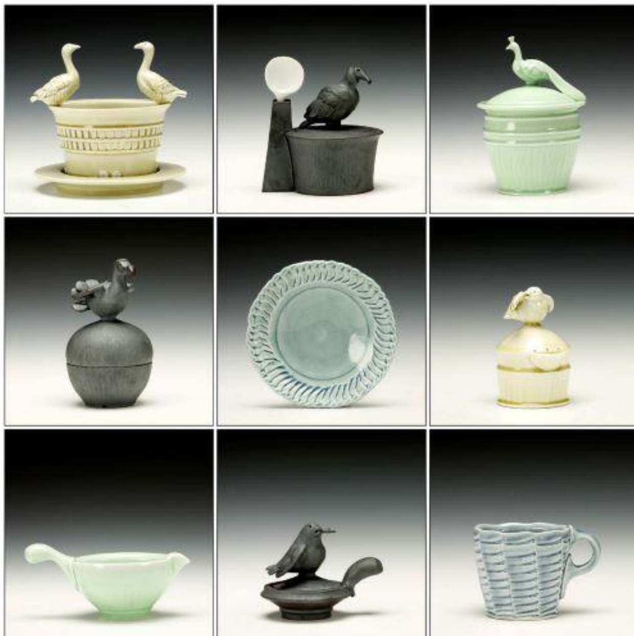
Steven Godfrey "Simply Sublime" at the Schaller Gallery

If you just enjoy looking at lovely pottery, as I do, I've included this display below as a feast for your eyes.