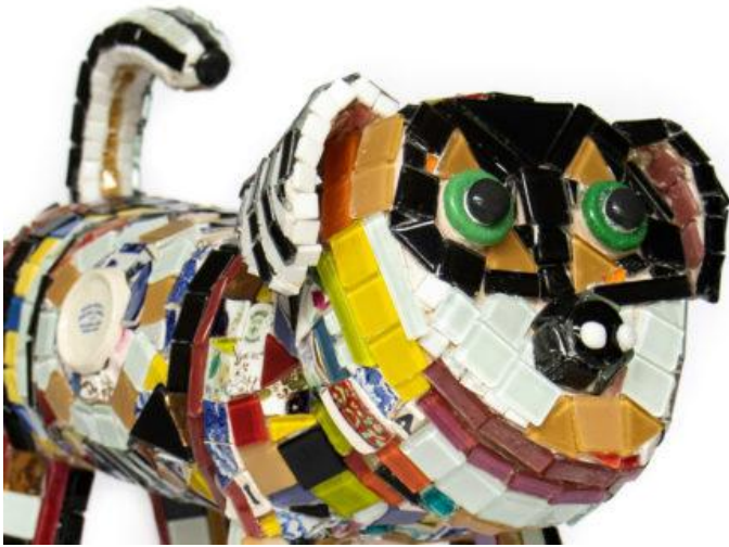
SIT . STAY . SPEAK NEW WORK BY SALLY MICHENER