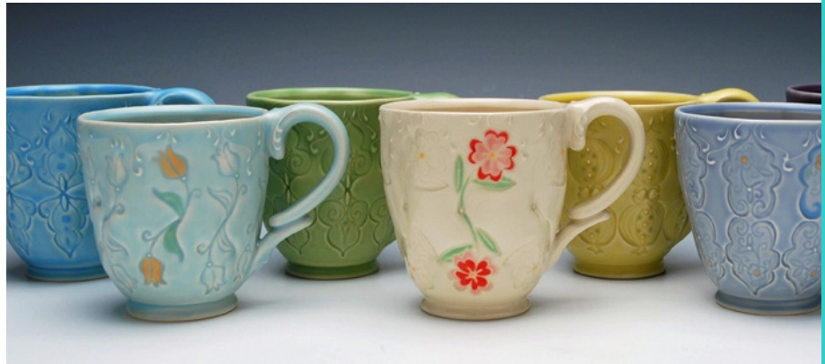
Kristen Kieffer Porcelain cups